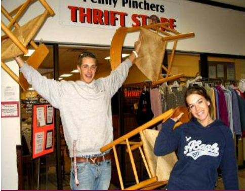
Penny Pinchers Thrift Store offers high quality, low cost goods for everyone.

In the past year we have seen the Discovery Initiative for disengaged youth grow, we have added a Diversion Plus component to our Diversion program which will serve more serious and violent youthful offenders, and our NETS program has expanded to a second campus, NETS West in Minneapolis.